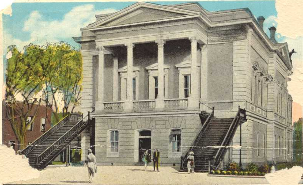
C-40:—RICHLAND COUNTY COURT HOUSE (BUILT IN 1870), COLUMBIA, S. C.