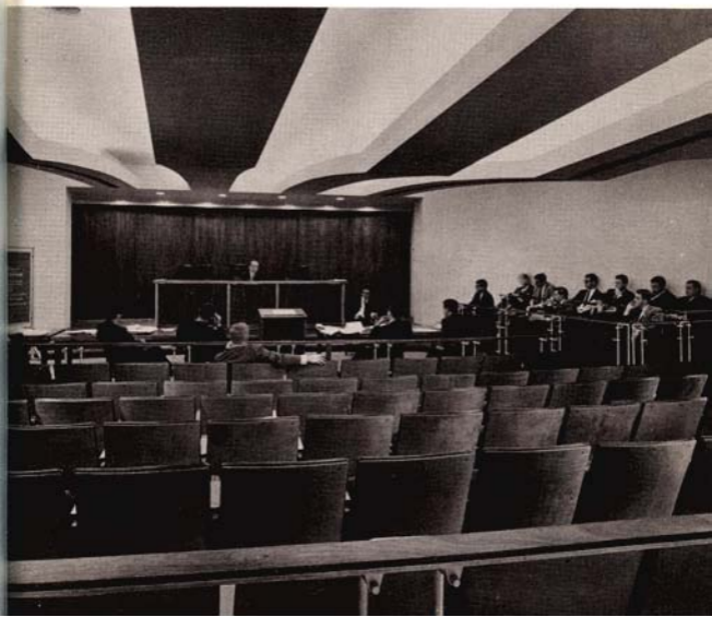
A Trial Tactics Class in the Moot Court Room