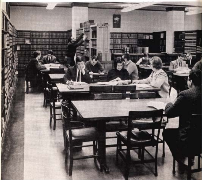
The Law Library.