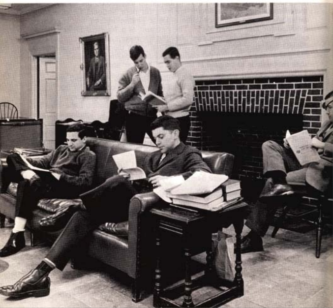
The Student Lounge.