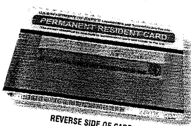
REVERSE SIDE OF CARD