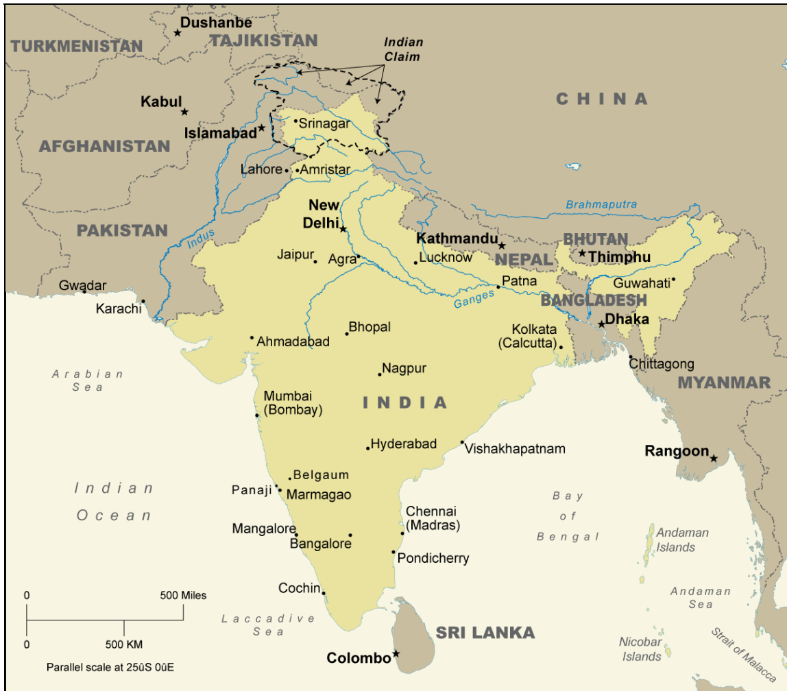
Figure 4. Map of India