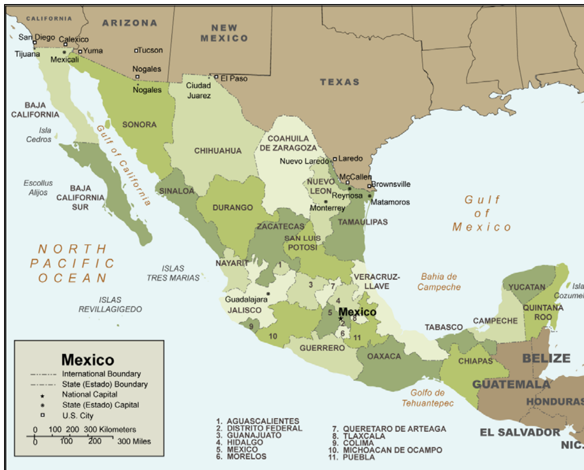
Figure I. Map of Mexico, Including States and Border Cities

Over the past decade, Mexico has transitioned from a centralized political system dominated by the Institutional Revolutionary Party (PRI) to a multiparty democracy in which presidential power is increasingly constrained by Congress, the Supreme Court, and the country's governors. 1 President Felipe Calderón of the conservative National Action Party (PAN) won the July 2006 presidential election in an extremely tight race, defeating Andrés Manuel López Obrador of the leftist Party of the Democratic Revolution (PRD) by fewer than 234,000 votes. President Calderón began his six-year term on December 1, 2006. He is to be succeeded by Enrique Peña Nieto of the PRI, whom Mexico's Electoral Tribunal recently certified as the victor in Mexico's July 1, 2012, presidential elections. President-elect Peña Nieto is scheduled to take office on December 1, 2012.