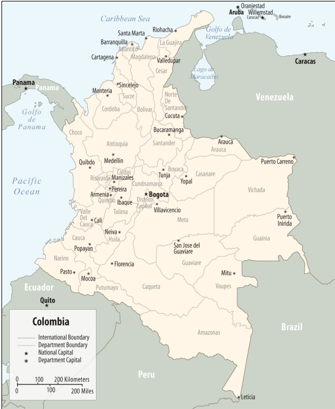
Figure I. Map of Colombia