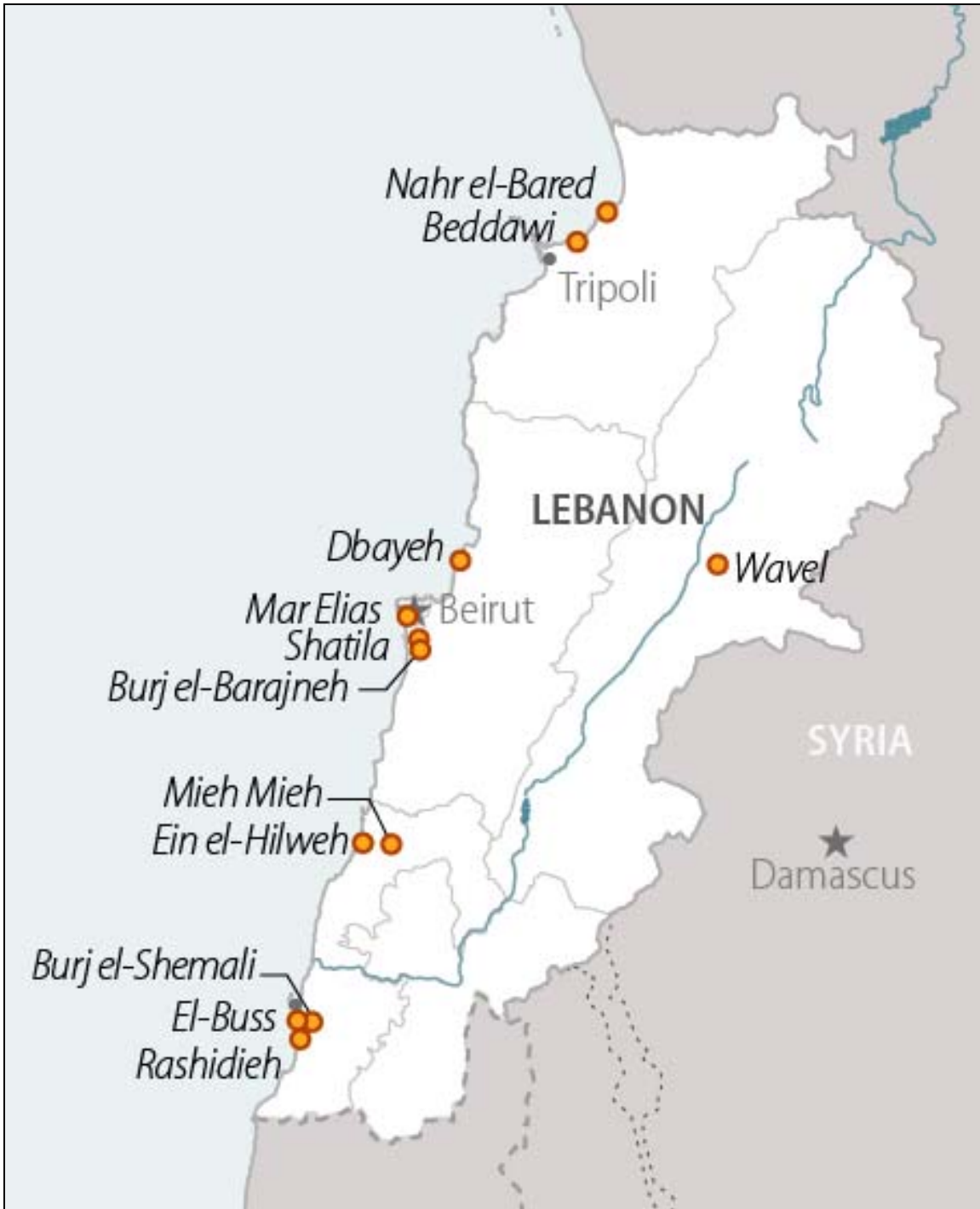
Figure 4. Location of Palestinian Refugee Camps in Lebanon