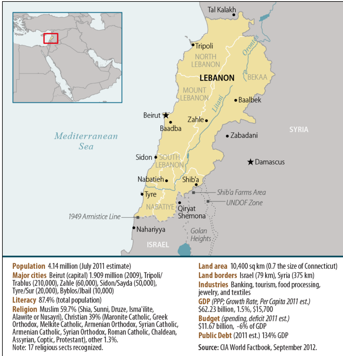
Figure I. Lebanon at a Glance