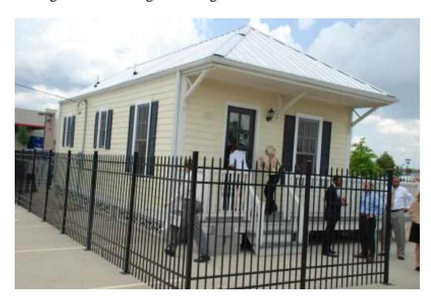
Photo 5 —New Orleans, LA, 06/11/2008. Federal, state, and city employees from Alternative Arrangements Housing Pilot Program Conference tour a two-bedroom Louisiana cottage model.