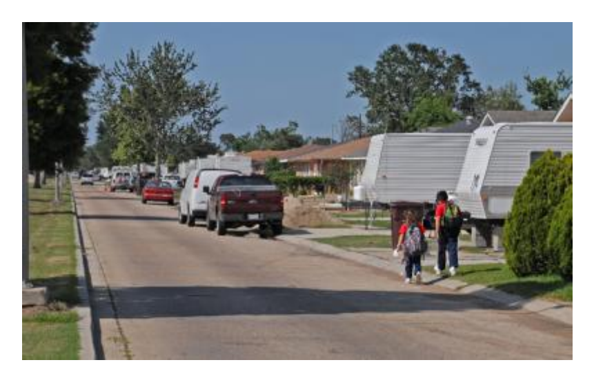
Photo 2 —Kenner, LA, 04/27/2006. Two school children walk home past FEMA Trailers that sit in almost every yard of E. Loyola Dr. in Kenner, a suburb of New Orleans that was damaged by Hurricane Katrina.