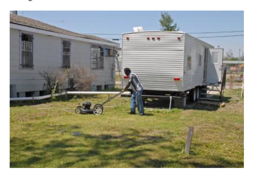
Photo 1 —New Orleans, LA, 04/09/2006. Behind his temporary home, the first person in the 9<sup>th</sup> Ward to get a FEMA Travel Trailer mows his lawn. He is repairing his Hurricane Katrinadamaged home.

Temporary housing units can be sited in several ways. Traditionally, FEMA provides smaller units (trailers rather than mobile homes) to homeowners repairing their homes (see photo 1 and photo 2). Members of those households can sleep in the units, sometimes parked in their driveways or on their yards, while making the necessary repairs to make their homes habitable. Small trailer size units that could potentially be moved on short notice, have also been employed for temporary housing in flood plain areas where less mobile forms of housing, such as manufactured homes, would likely not be acceptable under FEMA regulations for flood plain management.<sup>25</sup>