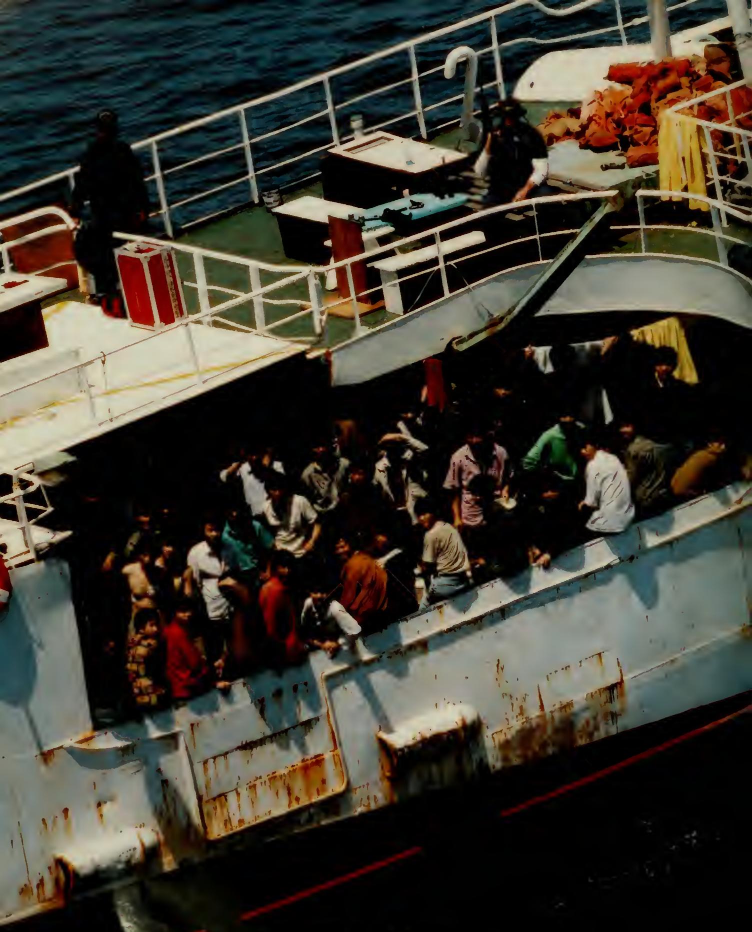
U.S. guard watches aboard ship found carrying undocumented Chinese.