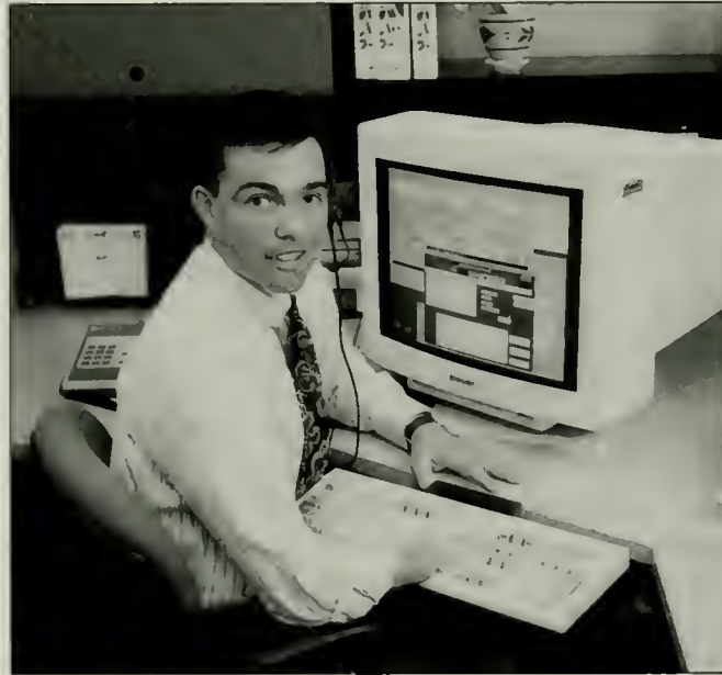
Communications specialist needs no job accommodations.

mid-1980s, it decreased 15 percent for men with disabilities. The labor force participation rate of women with disabilities increased 30 percent during that period, but this was only 83 percent as fast as the growth among women without disabilities (Yelin 1989). People with disabilities frequently work part time and at low wage jobs and thus have limited access to benefits such as health insurance and retirement. Likewise, career advancement for people with disabilities is limited (Braddock and Bachelder 1994).