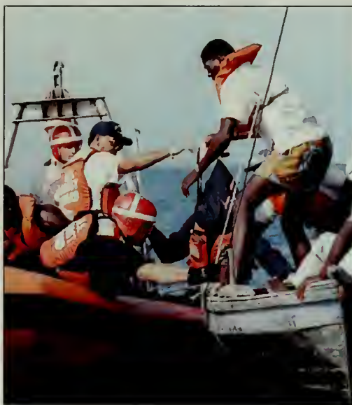
Haitian migrant receives a hand at sea.

Other concerns fall into two categories: governmental competence, and protection from abuse and of privacy. Government is not very good at maintaining or correcting data bases. For example, in an INS pilot telephone verification project involving immigrant workers a few years back, 28 percent of the individuals checked were not in the INS central data base—an indication that they might not be eligible to work. Further investigation, however, revealed that the majority of those individuals were legally authorized to work. The issue, then, becomes how to handle the inevitable costly "mistakes," which would fall disproportionately on ethnic minorities, the rural poor, and immigrants.