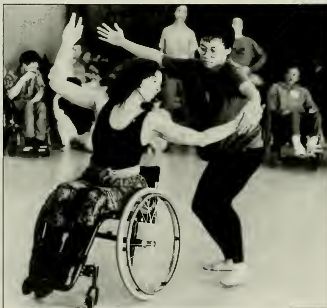
Advances in technology help raise horizons.

Sixty percent of those responding to the 1994 Harris survey of people with disabilities believed that access to public transportation had improved in the past four years (Lou Harris 1994). People with disabilities, however, continued to cite transportation problems, such as poor access in rural areas and lack of compliance with ADA standards for paratransit. People with disabilities are concerned that the disabled as a group are not accepting their responsibility to make a transition from specialized paratransit systems to general mass transit (PCEPD 1993).