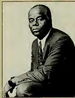
Dr. John Henrik Clarke

Among the thousands of students, scholars, and artists affected by Arthur Schomburg is one of his early protégés, the noted historian Dr. John Henrik Clarke, professor emeritus of African and world history at Hunter College's Department of Black and Puerto Rican Studies.