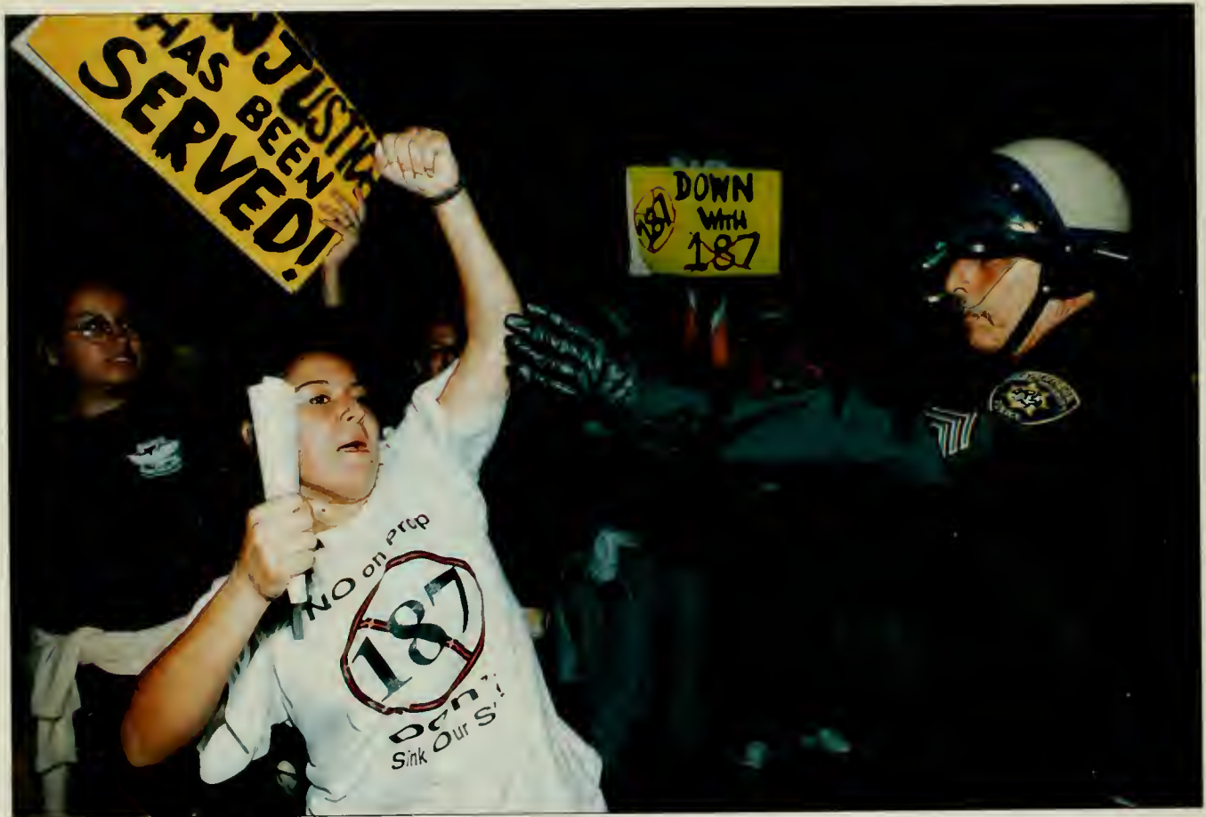
Demonstration protests Proposition 187 in California.

There are several sub-issues: Who would bear the burden of lost pay if Government error caused an authorized worker to lose a job opportunity? What procedures would there be for an individual to correct erroneous information in the data base? What safeguards would ensure that the Government and employers did not disclose unauthorized information about identity number holders? Would there be criminal sanctions, civil penalties, punitive and compensatory damages? Would individual Government employees be held personally liable? What would the enforcement procedures be, and who would bear the cost of attorneys to utilize them?