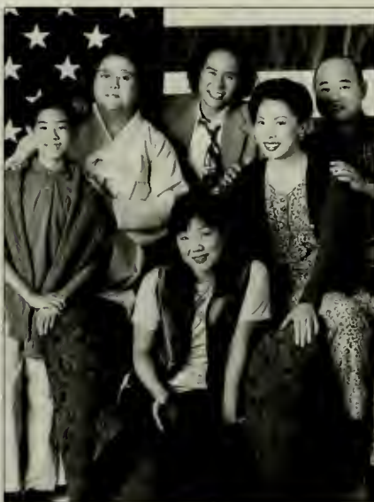
Cast of 'All American Girl'

It's been a long time coming and the trend is hardly a floodtide. The actor Russell Wong stars in a syndicated series, "Vanishing Son," a hip-