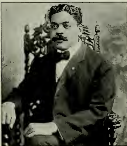
Arthur A. Schomburg

tered the flame which ignited his career. By his own account, he was in the fifth grade when a teacher glibly asserted that people of color had no history, no heroes, no notable accomplishments. Young Schomburg began a lifelong quest to refute scien-