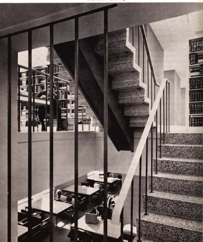
The Law Library