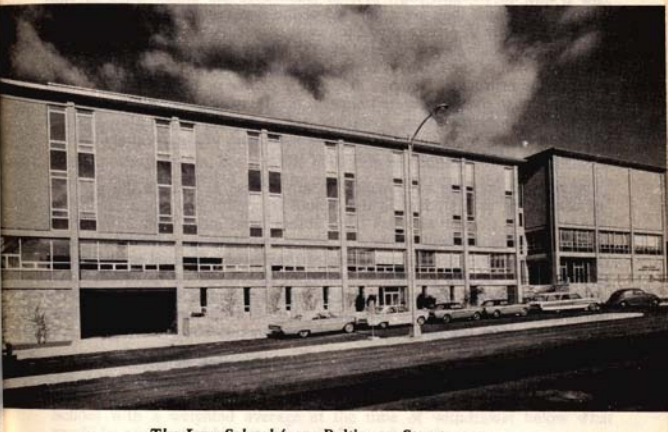
The Law School from Baltimore Street